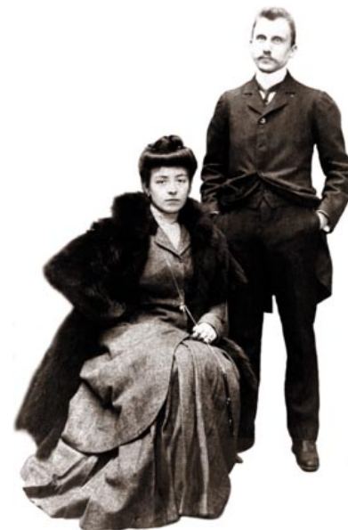
Blessed Luigi and Maria Quattrocchi's feast day will be celebrated on their wedding anniversary, November 25.